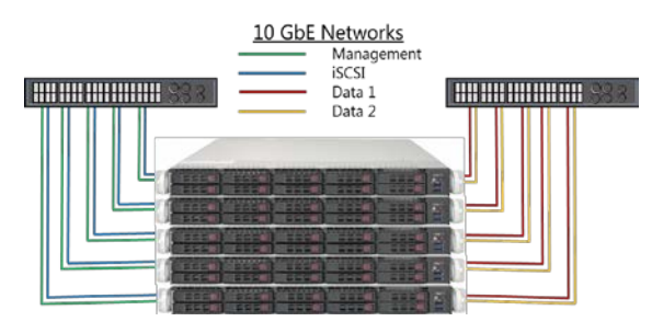
Figure 1: Micron and NexentaEdge Cluster Solution powered by Micron M510DC SSDs and advanced DRAM, NexentaEdge Software and Supermicro servers

This all-SSD solution (collaboratively developed by Micron, Nexenta and Supermicro) is optimized for faster results and better value versus legacy solutions. It provides predictably high performance and value that makes it easy to deploy and manage.